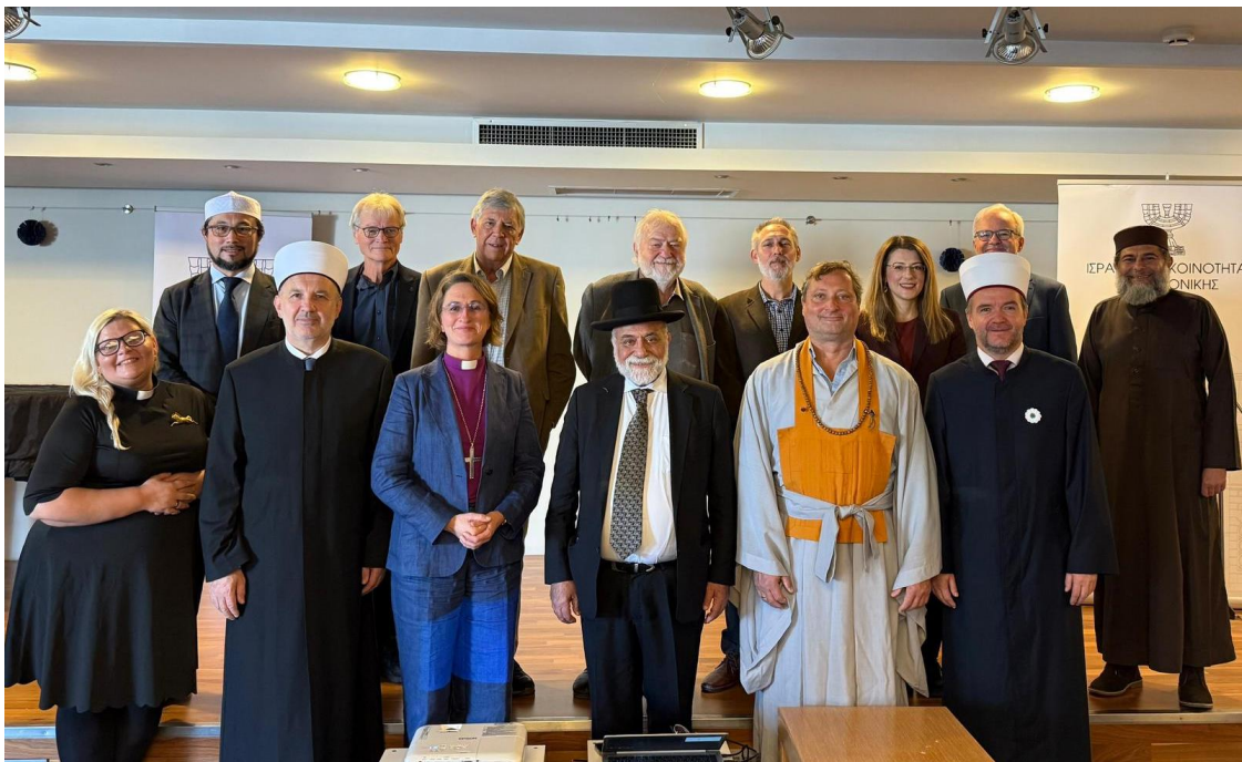
Annual Council Meeting, Thessaloniki 2026

The statements are important declarations of the Council's shared beliefs, so please do distribute as widely as possible, and disseminate to your communities and networks. The secretariat would also appreciate any contacts with media outlets through which we can share statements.