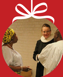
Strategies for dioceses and deaneries anchor Migrant cooperation.