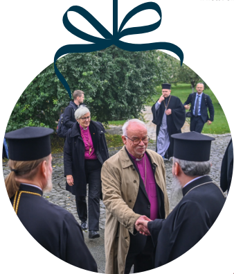
Nordic and Ukrainian bishops meet.