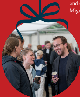
From the Ecumenical Week in Stockholm.