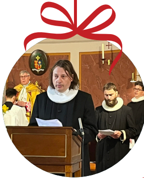
Joint church service on Easter Monday.