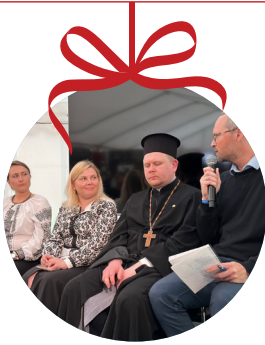
Panel debate at Heavenly Days.